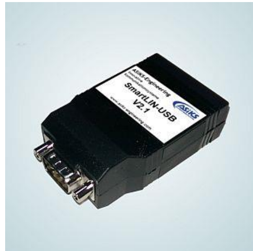
Figure 1: SmartLIN-USB Module

As it is an active interface, LIN Bus specific signals like synchronisation break and synchronisation delimiter are generated by the interface and hence no special algorithm is required by the host application.